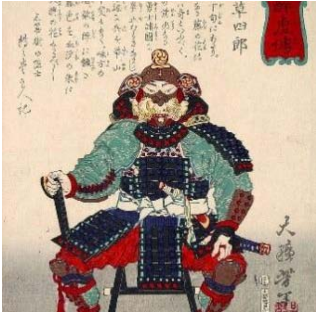
Later impression of Amakusa Shiro, c.1874.

As the rebels gained momentum, they impressed more into their ranks. Amakusa Shiro soon emerged as the rebellion's leader owing to his charisma. He even flew a Catholic banner to lead his troops.