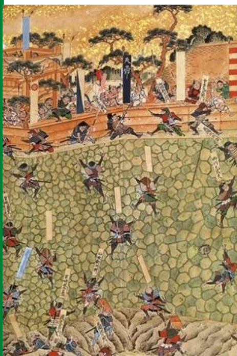
Anonymous, "Storming of Hara Castle by Shogunate forces", 18th century.

Discontented ronin (samurai without a master) and peasants launched an uprising against the Matsukura on 17 December 1637, assassinating the local magistrate in the process.