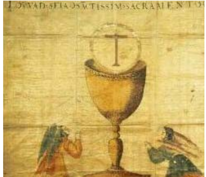
Banner of Amakusa Shiro during the Shimabara Rebellion. The text on the banner is medieval Portuguese reading "Praised be the Most Holy Sacrament".

The rebels resisted the siege for months and inflicted heavy losses on shogunate forces, even killing the commander of the besieging army in one instance. Nonetheless, both sides had a hard time fighting in winter conditions, and the rebels slowly ran out of food and ammunition; they held out until 15 April 1638, roughly four months after the rebellion began.